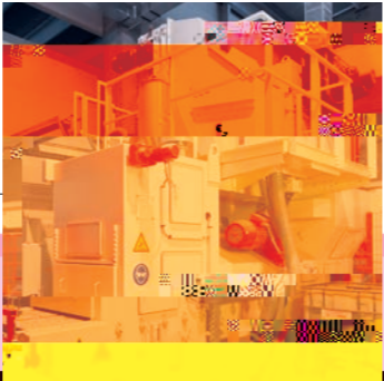
24 Shotblasting machine