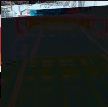
28 Coating line